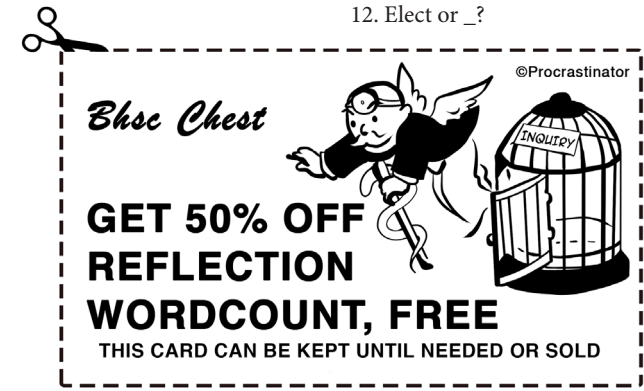
Sin of Commission